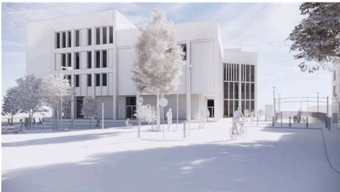
Artist's impression for the Dover Beacon project