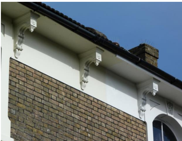
Above: Decorative corbel detail at eaves

Almost half of the doors are of a similar pattern, with the bottom two panels being solid with bolection mouldings and the top panels being semi-circular topped mostly glazed panels, whilst no. 11 has solid top panels with matching bolection mouldings. The latter is believed to be the most original door in Park Street. Replacement doors to the other properties are of a style and materials inappropriate to the conservation area.