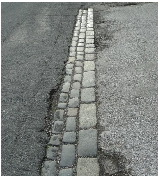
Original granite setts marking the entrance to the now developed timber yard