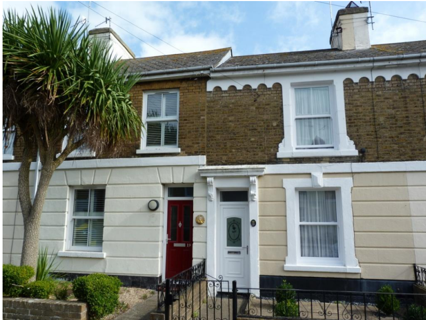
Possibly one of the earlier constructed dwellings to the left, with simple detailing to ground floor, and to the right a dwelling constructed at a later date, with more elaborate detailing to eaves and ground floor

Whilst the architectural openings for doors and windows set the scene for the street, almost all the original timber sliding sash windows have been replaced in uPVC, although some have a sash window appearance. Number 64 is well preserved with its original windows and front door; number 65 has the original style ground floor window. Many have retained glazing bars as a concept which help to maintain the detailed appearance, but others have opted for simple large panes of glass. Front doors have been handled in a similar varied way.