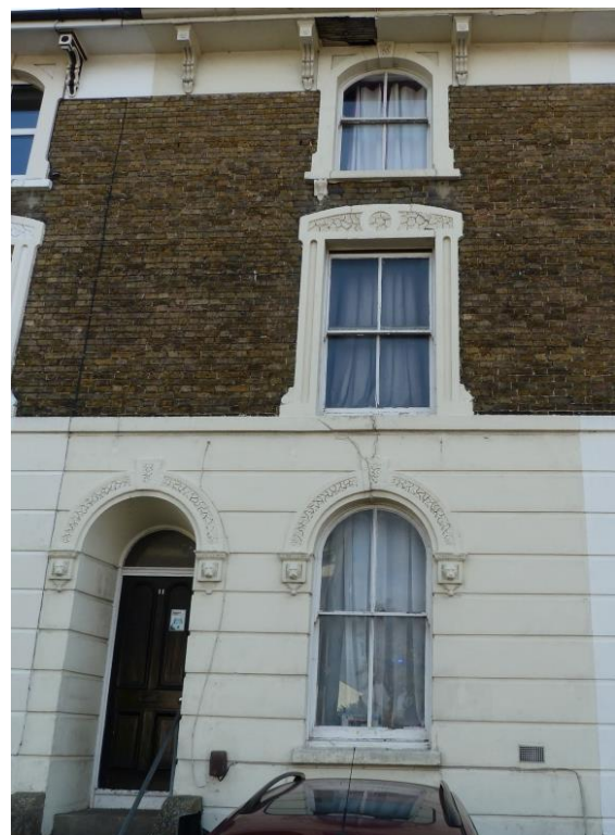
Right: The leopards head detail to the corbels reflects the coat of arms of the St Martin's Priory

The windows have decorated surrounds and are half round on the ground floor, rectangular on the first floor and arched on the top floor. Few have the original wooden box-framed sliding sash windows of a two over two glazing pattern with lambs tongue horns. Most have been replaced