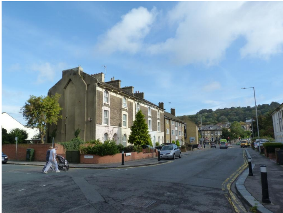
View out of the conservation area with Connaught Park in the distance

To the southwest, two trees in Ladywell car park and an imposing view of the Grade II listed former School of Art dating from the 1890s draw the eye. Beyond is the High Street which is in the Dover College Conservation Area. To the northeast there is a natural focal point at Clyde House on the junction of Godwyne Road, Park Avenue and Maison Dieu Road (the Five Ways) which is backed by the trees of Connaught Park.