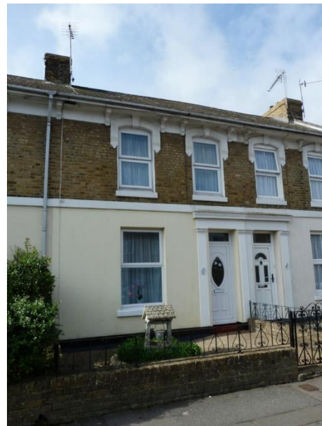
Examples of inappropriately detailed replacement UPVC windows