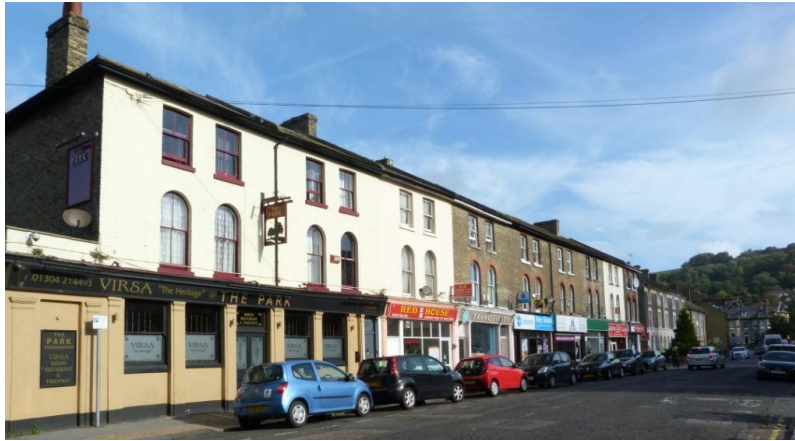
The conservation area has a vibrant mix of commercial and residential properties