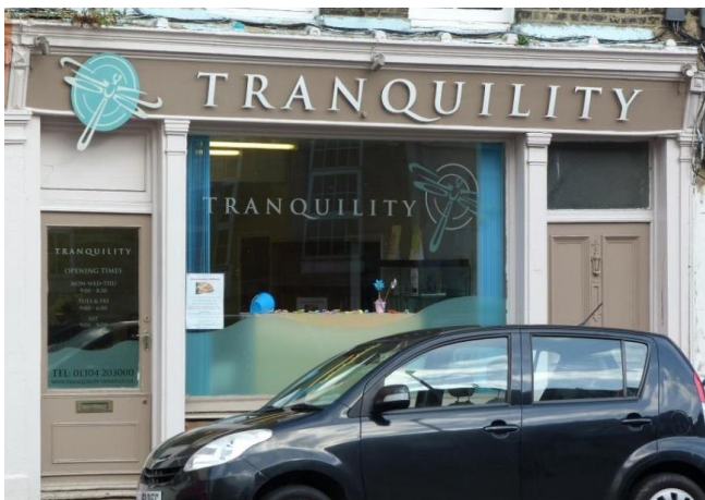
A traditionally detailed shopfront, with key features such as pilasters, corbels, shutter box and sensitive signage

The roofs are mainly slate either natural or man-made and two are concrete tiled. Number 9 on the corner with Dour Street has an interesting lead hipped roof which tapers to a point at the ridge. Below this to the upper two floors is an impressive large, curved feature. Many of the chimney stacks are missing.