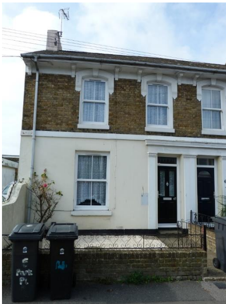
Example of appropriately detailed replacement sash windows

The lack of additional planning control, such as an Article 4 Direction, over details such as the replacement of windows and doors in dwellings was very evident. The very high number of uPVC windows is a matter of concern as it detracts from the character and appearance of the historic buildings. The consistent colour of the painted render of all the houses is important to the rhythm of the terraces, but there is already some evidence of this being lost in Park Street. In addition, the loss of most of the original historic shopfronts and replacement with modern shopfronts and signage that is out of scale and of inappropriate materials has degraded the quality of the commercial premises.