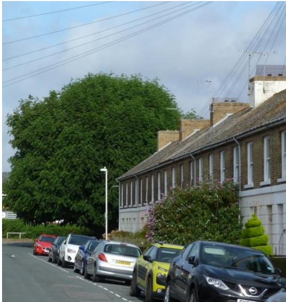
View of Dour Street

Dour Street is a long, straight street, less than five minutes' walk from the High Street with a quiet but active and pleasant atmosphere. Constructed between 1859 and the early 1880s, there were around 66 houses in total plus a bakery to one end of the road. Originally, the buildings on both sides of the street were constructed within a relatively short timeframe and to a consistent pattern. A narrow access road through the southwest terrace led to a wood yard at the rear.