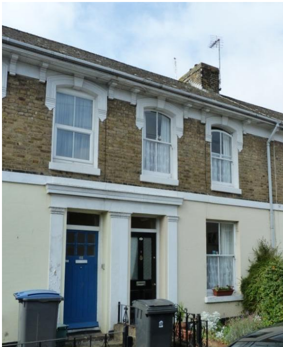
Properties to the southwest side of Dour Street

The house elevations to the northeast terrace conform to two distinct patterns which break between Nos 18 and 19. The houses to the west of the break line (nos. 19-31) have the simplest detailing on Dour Street, which suggests that they may have been the first built. The front eaves have a short, simple projection. The upper wall is yellow stock brick and the upper windows are simply set within the brickwork, with brick voussoir lintels and thick projecting, painted stone sills.