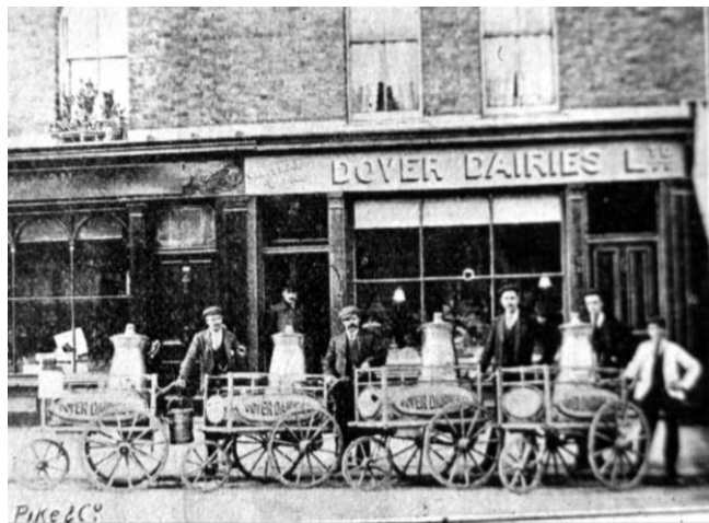
Park Place, early 20 th Century

Park Place, on the north side from the river to Dour Street, was laid out by Gorely as a parade of shops with the proviso that they should not compete with his businesses! On the south side, and currently excluded from the conservation area, is the 1938 Police Station on the site of Ladywell Place, a small lane with a series of terraces showing on a map dating to 1851. During the Second World War bombs wrecked some houses in Dour Street and Park Street, with some eventually fully demolished and others repaired.