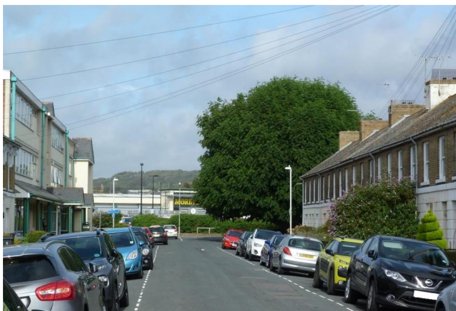
View towards the northwest. The large block on the left is outside the conservation area.

far distance there are the tree covered slopes of Old Park Hill. It is noted that the planting zone at the end of Morrison's is wide enough to support a much higher planting screen than it supports at present, which would be helpful in closing off the vista. The harmony of the street scene is jarred by the two storey cream painted gable walls which finished off the terraces that survived the bombing and council clearance works. Despite being outside the boundary of the conservation area, the three storey residential block feels overbearing due to its additional storey and bulk, although it has been set back from the existing building line which has mitigated this slightly. It is crudely detailed with no articulation to the street elevation and is considered to have a negative impact on the character of the conservation area.