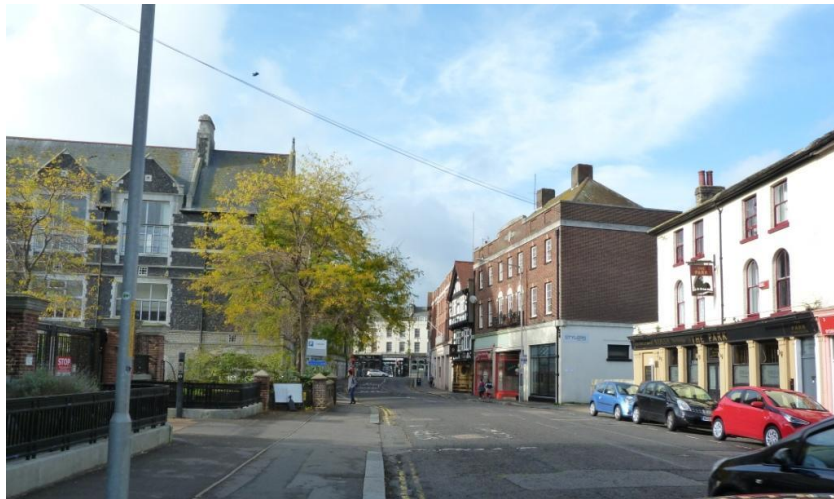
View from Park Place towards the art school and Maison Dieu

To the southeast, there are two trees in Ladywell car park and the view is of Ladywell, the fire station, the Grade II listed former School of Art dating from the 1890s and beyond to the High Street which is part of the Dover College Conservation Area. The River Dour forms the boundary between Park Place and Ladywell, but unfortunately this valued asset is hidden from view by protective walls. To the north-east there is Park Street and beyond there is a natural focal point at Clyde House on the Five Ways which is backed by the trees of Connaught Park.