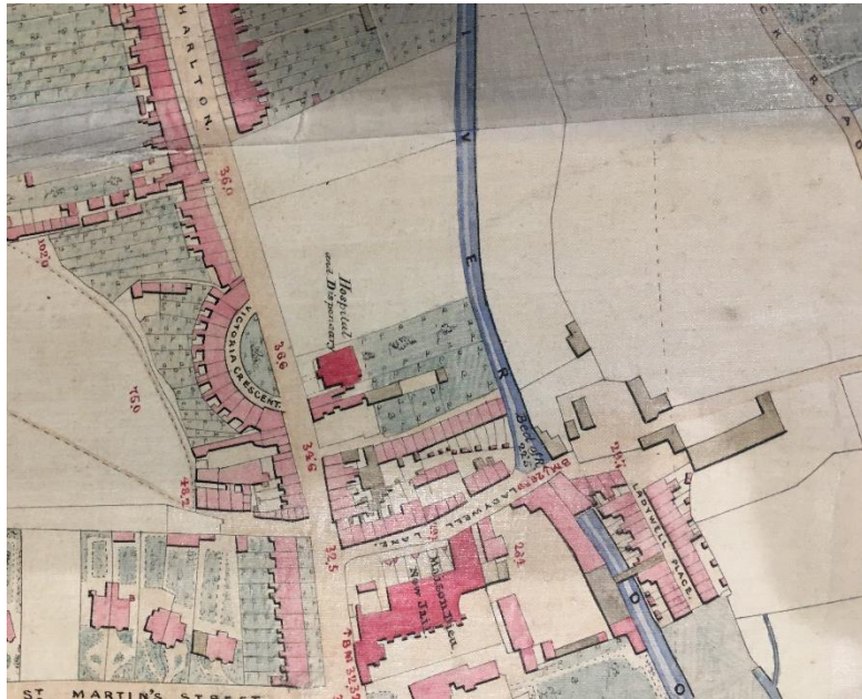
Public Health Map, 1851