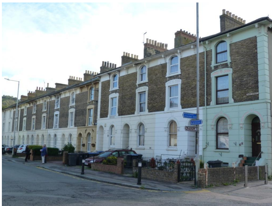
A view of the buildings on Park Street