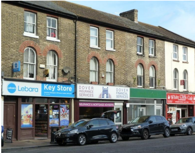
Unsympathetic shopfronts where large fascias dominate the elevation