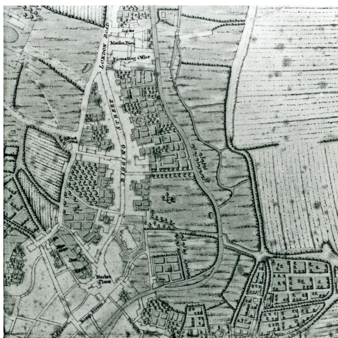
1737 Map of Dover

Until the Dissolution of the Monasteries in the 16 th Century, the area where the Dour Street Conservation Area now extends belonged to the Maison Dieu Pilgrims' Hospice. Founded in c.1203 and taken over by the Crown, the Maison Dieu buildings became a Royal Naval Victualling Store until the 19 th Century, whilst the surrounding lands, owned by the Crown, were let to farmers. A map dating to 1737 shows fields and woodland in the Dour Street area and the Park Street area seems to be divided into sections with sheds, possibly market gardens.