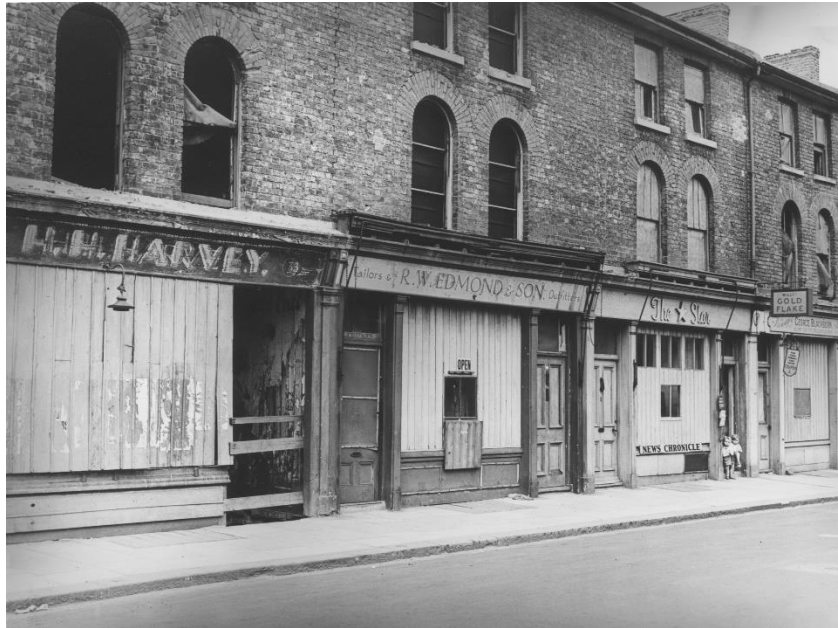
Park Street, late 19th Century