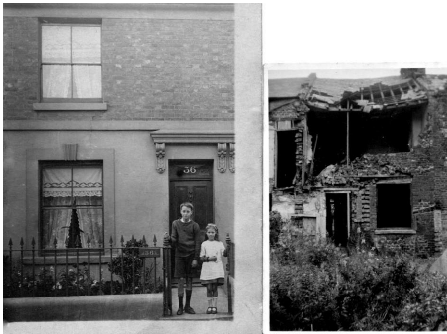
36 Dour Street, before and after the bombing of the Second World War

In 1947 Dour Street and part of Park Street were compulsorily purchased by the Borough Council, and 158 houses from the Crown Estate in Maison Dieu Road, Dour Street, Leyburne Road and Harold Street in 1958. Dover District Council still owns a significant number of houses in the conservation area.